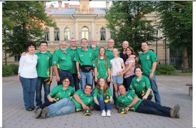
The whole gang