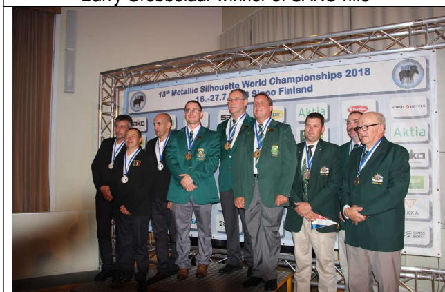
Small Bore Handgun Team - Gold