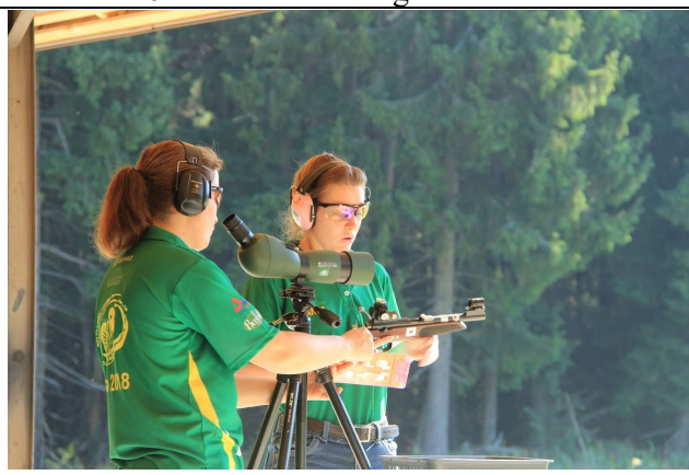
Action in Small Bore HG Standing