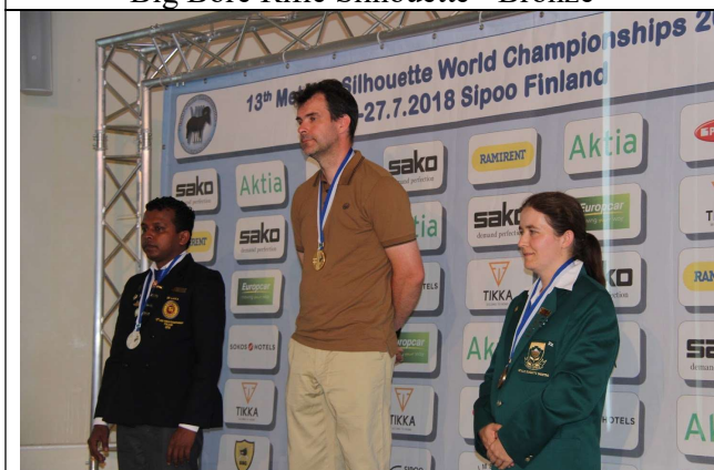
Air Rifle Standing - Bronze