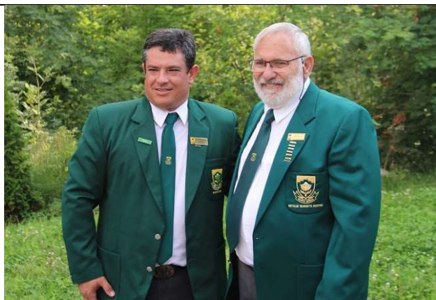
Coach and President of SAMSSA