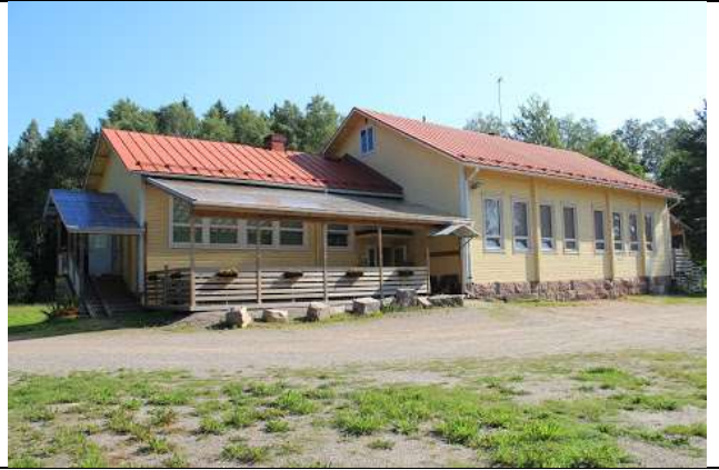
Residence for the stay – Villa Svensk