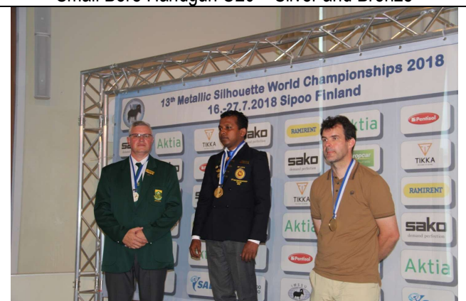
Small Bore Rifle Silhouette – Silver