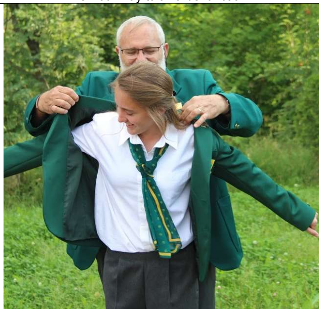
U20 member receiving Protea Blazer