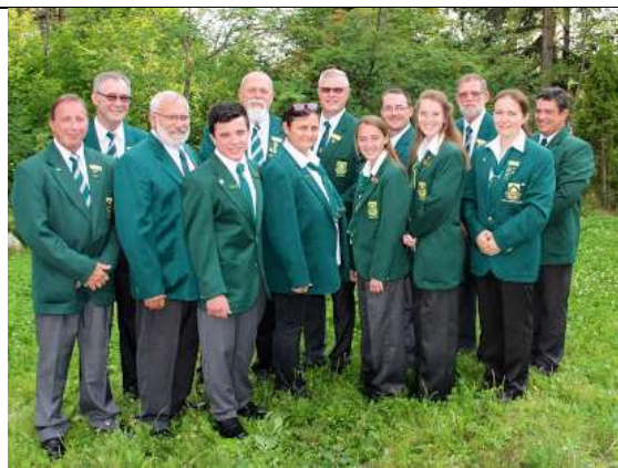
On our way to awards function