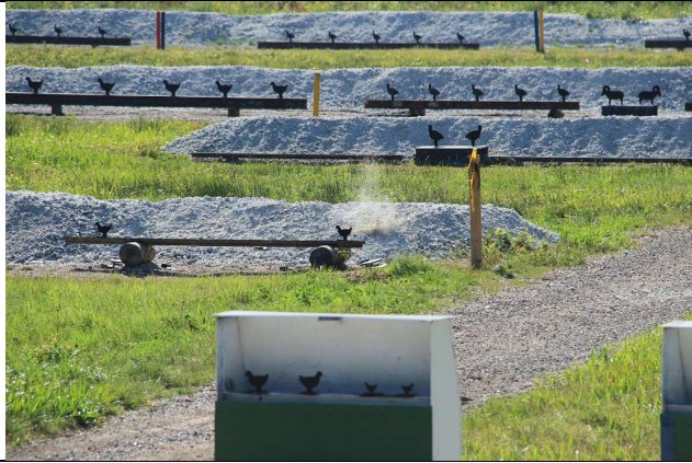
Action shot on Small Bore Handgun