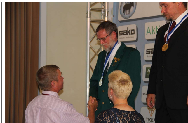
Field Pistol Any Sights - Silver