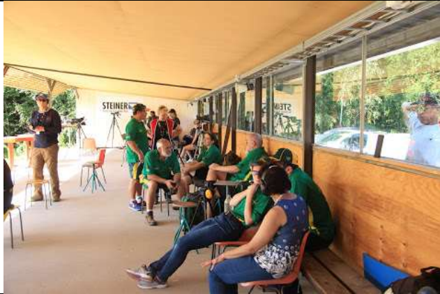
Team spirit on the range