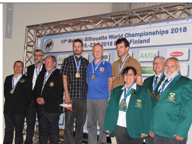
Big Bore Rifle Team – Bronze