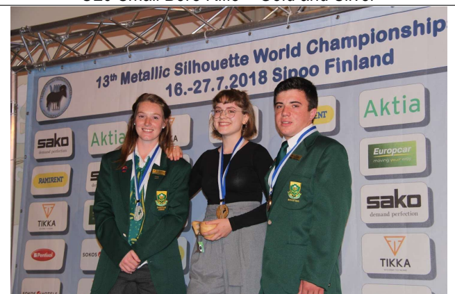
Small Bore Handgun U20 – Silver and Bronze