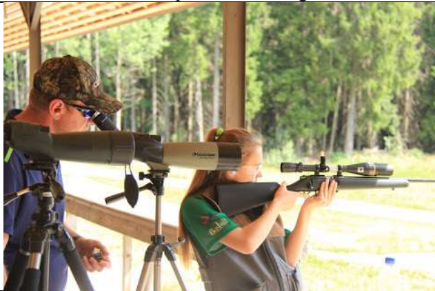
U20 Rifle shooting