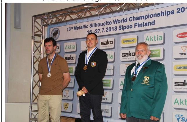
Big Bore Rifle Silhouette - Bronze